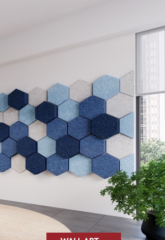
WALL ART ▲